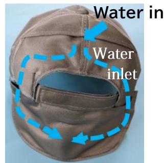
The internal flow of water

From the back of the head that controls the autonomic nerves to the entire back of the neck, it can cool for several hours